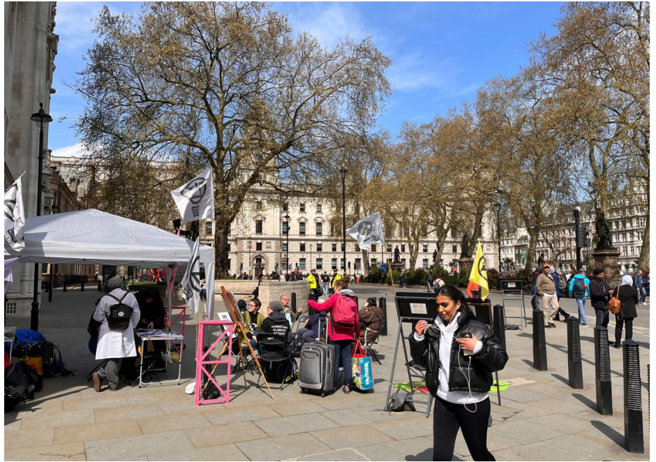
The pavement outside the Supreme Court in Parliament Square, partially blocked by protestors attending 'The Big One' in April 2023