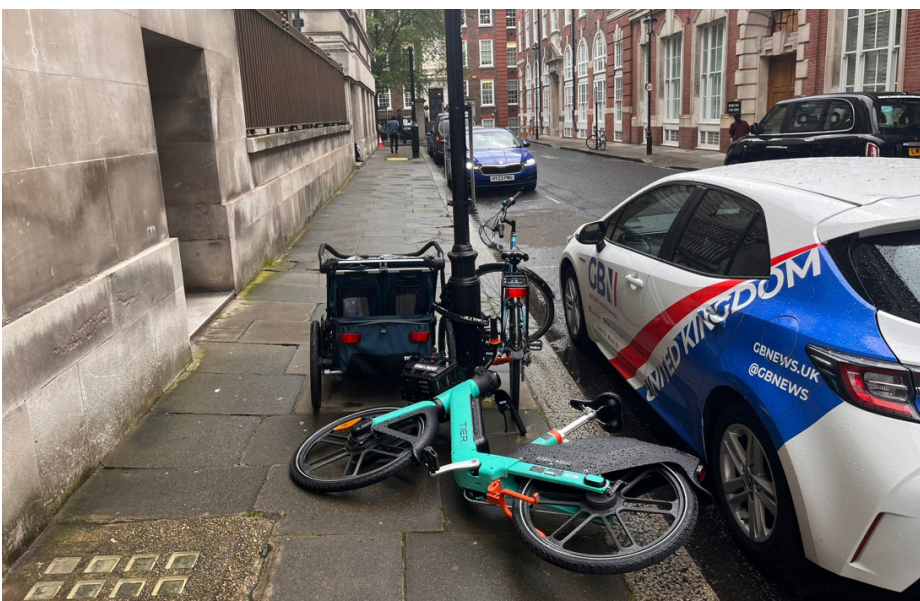
An e-bike partially blocking a pavement near to Parliament Square

Due to their design of not needing to start or end journeys at designated docking stations, the vast majority of publicly hired e-bikes and scooters are left by their users on pavements. While often programmed in a way which prevents them from being left in certain locations, such as Parliament Square or Westminster Bridge, they can be left after use on the streets nearby. Given the particularly narrow pavements on the streets near to the Parliamentary Estate this can lead to a situation which is not only merely irresponsible but actively dangerous for pedestrians, particularly those who are using a wheelchair or visually impaired. This is especially the case where e-bikes or scooters are not parked upright but are left lying on the ground, often across the full width of the pavements.