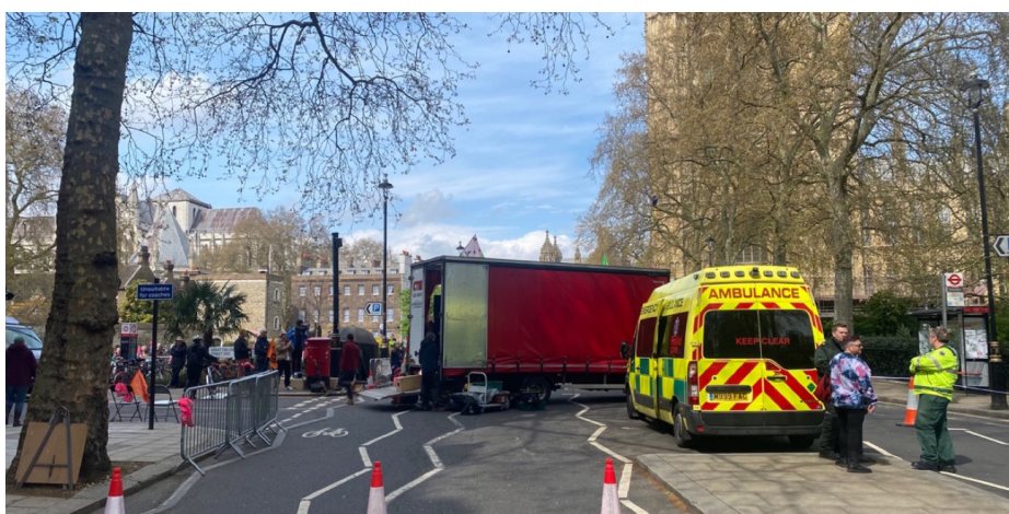
The back of the sound stage at 'The Big One' at the road closure at Abingdon Street and Millbank

It is often said that as part of being a liberal democracy it is necessary to exercise a constant balancing of the conflicting interests and rights between different groups. In Westminster this is a particularly challenging task. When individuals wish to protest, it is perhaps inevitable that they might wish to do so in a place where Government and Parliament enacts its business. That an act of protest is irritating or frustrating is not in and of itself a reason for it to be prevented. Balanced against this of course are the rights and interests of the thousands of individuals who visit and work in and around the Parliamentary Estate.