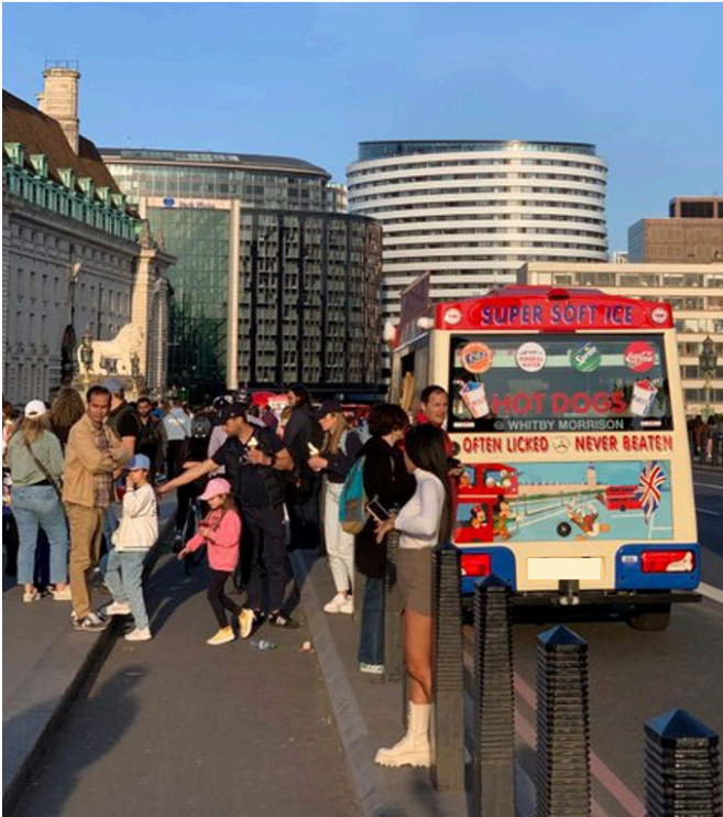
An ice cream van parked on double red lines on the south side of Westminster Bridge with customers queuing and blocking the cycle lane 18