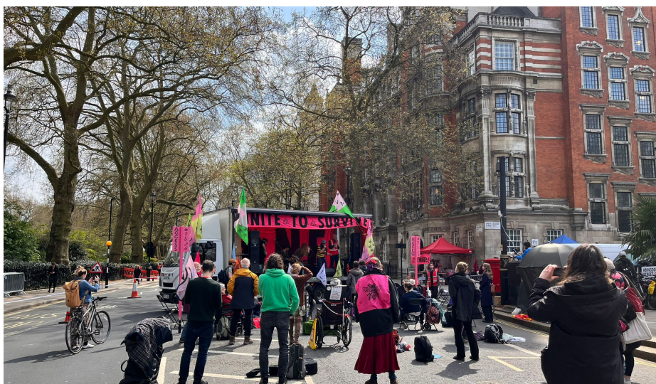
The mobile sound stage positioned across the carriageway on Millbank during 'The Big One' in April 2023