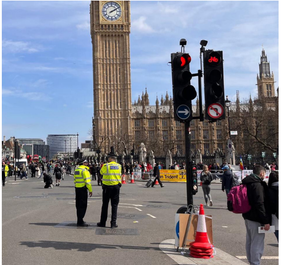
Police officers enforcing road closures in Parliament Square during 'The Big One' in April 2023

The National Travel Survey 2021 found that for those with a mobility difficulty the number of pedestrian trips taken (131 per person) were around a half of those taken by those without a mobility difficulty (243 trips per person). 13 Those with mobility difficulties are 10% more likely to travel using car, taxi or other private transportation over alternative transportation options when compared with those without mobility issues. 14 Yet regularly parliamentarians and those who work on the Parliamentary Estate are advised not to use their cars to travel to parliament due to protests which are taking place. Again, this appears to be an example where not only are the rights of protestors given greater weight than the rights of others, but the rights and specific needs of disabled people are not being given sufficient weight at all.