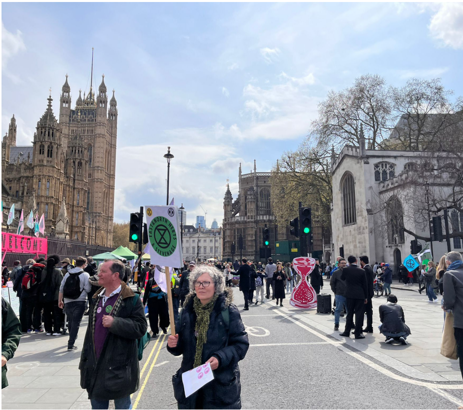
The pavement on Parliament Square blocked by a combination of protestors and stalls on the weekend of 'The Big One' in April 2023

pass through the demonstration safely in order to access the Parliamentary Estate.