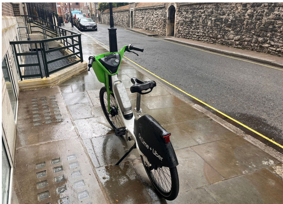
An e-bike partially blocking the pavement in Westminster, near to Parliament Square

A relatively recent feature of many cities and urban centres, but particularly central London, has been the increasing prominence of e-bikes and e-scooters. Over recent years they have increased in usage and popularity. Unlike the TfL public bicycle hire scheme (often known as ‘Boris Bikes’ after the Mayor of London when they were first introduced in 2010) where bicycles are hired from and returned to designated docking stations, more recently rolled-out e-bike and e-scooters are designed to be hired from and then left in any location.